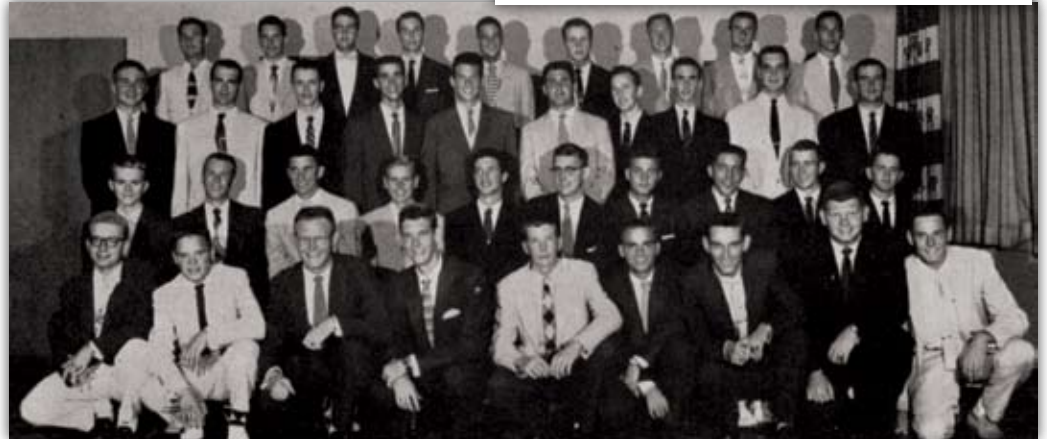
Below: 1957 pledge class.