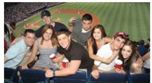
Several Brothers enjoy an Atlanta Braves game over the summer.

Entering into the fall semester, the Brothers focused hard on rush and worked together to bring in 18 new pledges. The new pledges hail from various states and cities. Looking towards the fall semester, the Brothers are very excited