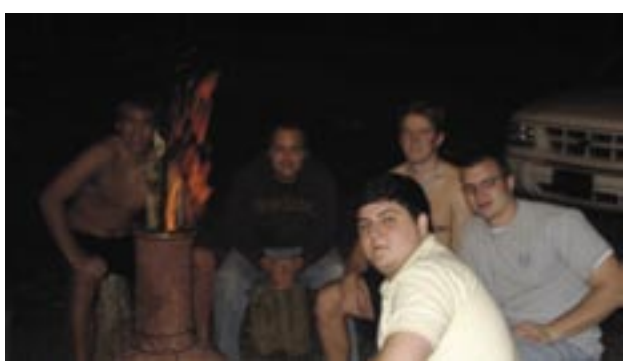
A few brothers relax by a fire while spending the holidays together.

are also welcome to attend.) The afternoon will include a baseball game at 1:00 p.m. followed by a dinner and awards ceremony. To finalize our social calendar, the undergrads will have yet another chance to apply their engineering skills for the week-long Luau preparation. We are going to start updating our website on a regular basis to keep you informed of current events. Hope to see everyone in 2007.