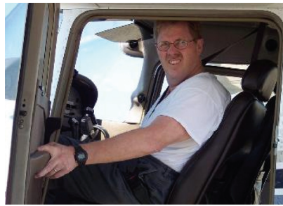
My Anniversary Flight 7/16/06