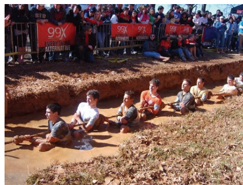
Tug-a-Lug! Several brothers participate in the annual Tug competition.

Nearing the end of the long school year, the brothers took a break from the rigors of class work to host the annual Luau party. It took brothers a week put up a pool and extend the deck around the pool. After the weekend of relaxation, the brothers ended the semester by preparing for finals and anticipating the summer.