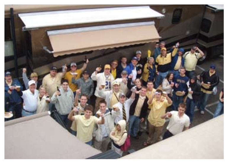
Alumni tailgates are moving to the Kappa Sigma house!

Over the past few months, two seemingly unrelated events came together to provide Alpha Tau brothers an opportunity for fellowship across generations. The first was the continued uncertainty in the economy. The second was the continued expansion of Georgia Tech facilities. "Huh?" you say "What in the heck do these have to do with each other, and how could the lousy economy provide an