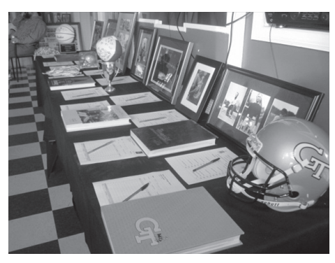
Some of the items available at the farewell party's silent auction.

your pledge yet, we still need your help! Let's lessen the load on our undergraduates and pay for as much of this place as we can as alumni.