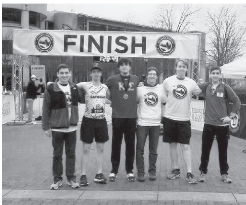
Alpha Tau brothers participated in the Atlanta Mission 5K Race to End Homelessness in February.

Recruitment-wise, Alpha Tau has a larger-than-typical spring pledge class this year, not to mention one of the largest pledge classes on campus, with nine new members. The chapter held bonfires and lunches as part of their recruitment efforts, and boast one