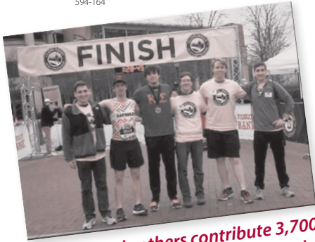
Alpha Tau brothers contribute 3,700 hours and raise $10,773 for local charities. Read more on page 2

R.I.P. to the EC Lot Ma Tech Finally Wises Up to Kappa Sig's Decades of Free Parking